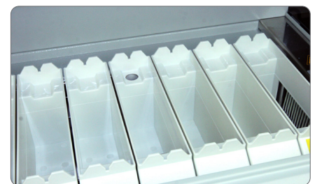
Up to 18 stations for reagents