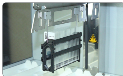
Loading up to 30 slides simultaneously