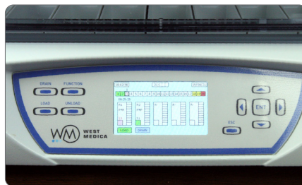
Run the automated staining cycle