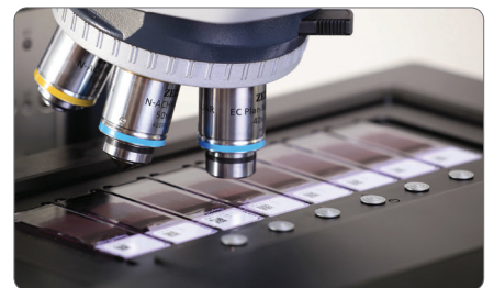
Get the slides with standardized staining