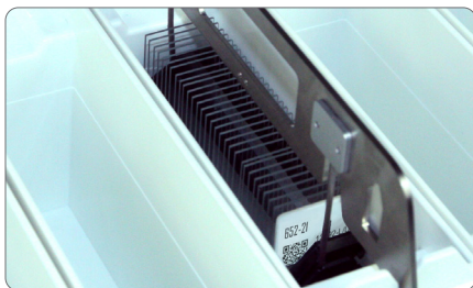
Place the slides into the holder